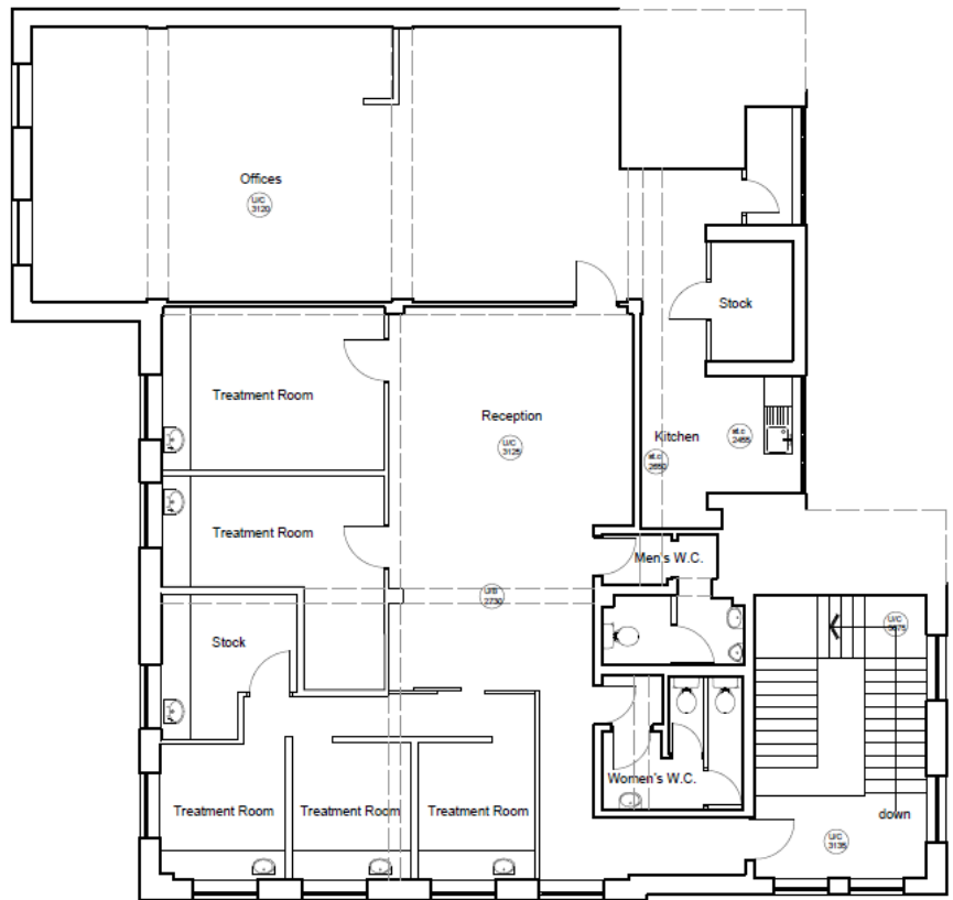
First Floor Plan: 2630 sq ft

Suite 2, 6 Farmhouse Way, Monkspath, Shirley, Solihull, B90 4EH